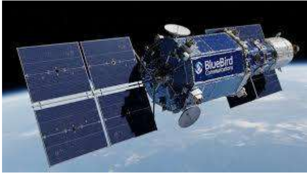
BlueBird satellite (image representation purpose only)